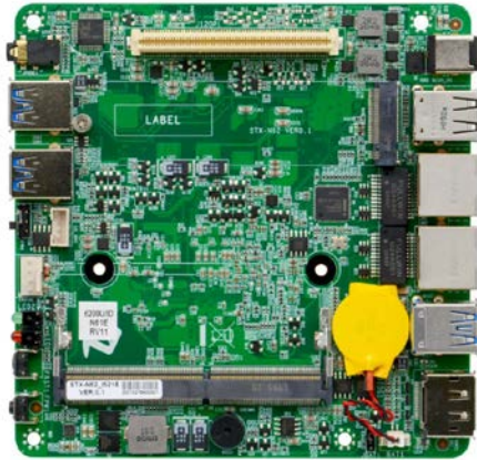
EPIC-N81_I522E VER1.0 Front view