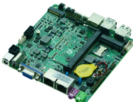
STX-N61_I521E VER:1.1 side view